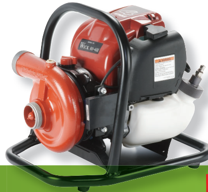
WICK 80 (RFTC MODEL)